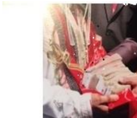
Hundreds of thousands of Rupees in cash are gifted to Australian-Indian grooms as dowry

The daughter on the other hand is a losing proposition. The parents educate her, invest emotional energy but unless they give dowry she cannot get married. If the Indian groom happens to be a resident of USA, Canada, Australia, UK much the better, he will command dowry in millions and billions. Dowry has become a status symbol. The rich want to show off their wealth by giving big dowries and the middle and lower socioeconomic classes feel the burden to copy the rich. Is it then a surprise that female babies in India are constantly aborted and female infanticide is a problem? This has given rise to an abnormal male to female sex ratio where males predominate. Is it happening in Australia? The answer is YES, and is provided by Christopher Guilмото, UN gender expert. He says Indian and Chinese communities combined account for a "missing 1400 female foetuses" between 2003 and 2013. Between the decade studied (2003-2013) the sex ratio was 105.7 males per 100 females for Australia as a whole. For Indian born parents the ratio was 108.2 boys per 100 girls, and for Chinese-born parents, average of 109.5 boys were born for every 100 girls.