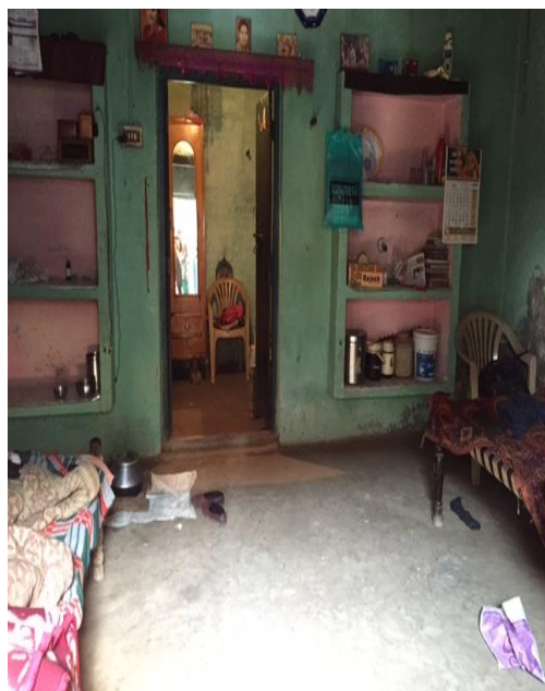
Typical home in Jheeram Pura

Jheeram Pura is located 50 km North West of Delhi and about one hour drive from the City. The total number of inhabitants is 520 approx. Majority are males 220, with lesser number of women 190 and 120 inhabitants are under 16 years. There is preponderance