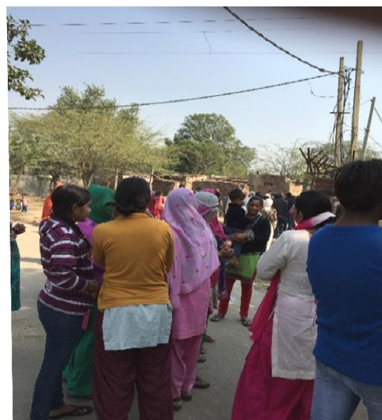
Women listening to men discussing the location of public toilet with Dr Udit Raj MP's team member

Jheeram Pura is located 50 km North West of Delhi and about one hour drive from the City. The total number of inhabitants is 520 approx. Majority are males 220, with lesser number of women 190 and 120 inhabitants are under 16 years. There is preponderance