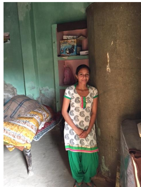
Young woman at home in Jheeram Pura

A community based awareness raising on domestic violence and dowry related problems will also be supported by ACHRH.